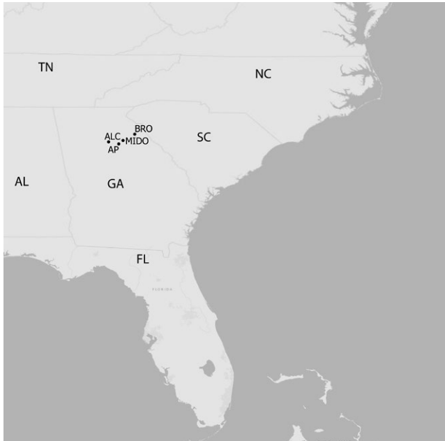
FIGURE 1 Map showing the south-eastern U.S.A., with the four studied rivers marked. From west to east, the Alcovy River (ALC), the Apalachee River (AP), the Middle Oconee River (MIDO), and the Broad River (BRO)

We selected these rivers as they vary in discharge and catchment area, which ranges from 80 to 1,031 km 2 above the sampling reach. Additionally, they span three large catchments in the Georgia piedmont: the Ocmulgee basin (Alcovy River), the Oconee basin (Middle Oconee and Apalachee Rivers), and the Savannah basin (Broad River). This sampling approach allows us to provide a more accurate regional estimate of Corbicula density and population size.