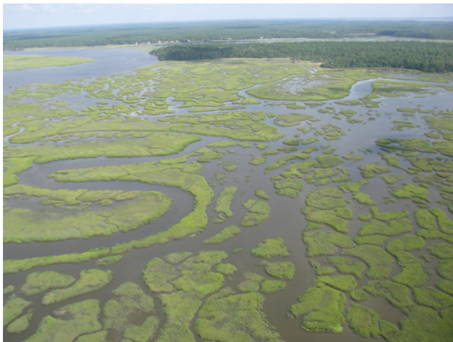
FIGURE 1. Aerial view of deteriorating tidal marsh in southeastern Georgia.